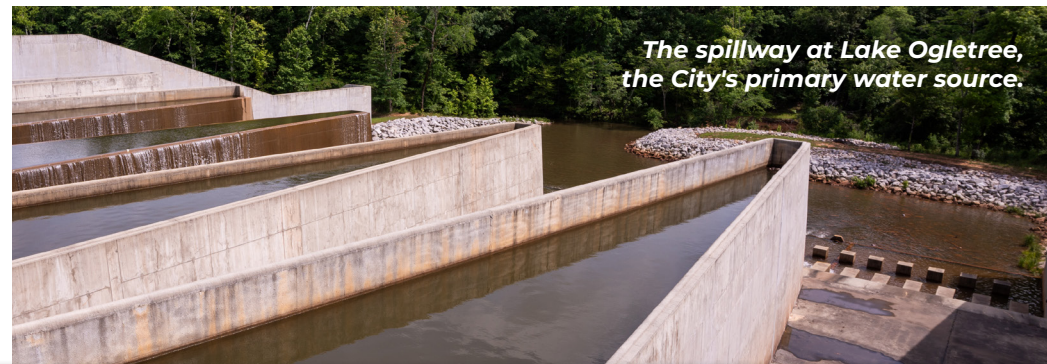
The spillway at Lake Ogletree, the City's primary water source.

Have questions? Contact the Water Resource Management Department at (334) 501-3060 or webwtrswr@auburnalabama.gov .