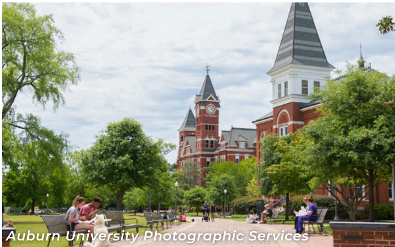
Auburn University Photographic Services

Downtown is the heart of Auburn and also serves as the front door to Auburn University. In the past several years, downtown Auburn has seen increasing levels of development and has continued to grow its footprint. It is lively with thriving retail that includes unique shops, fine and casual dining, quaint coffee shops, bookstores, banks,