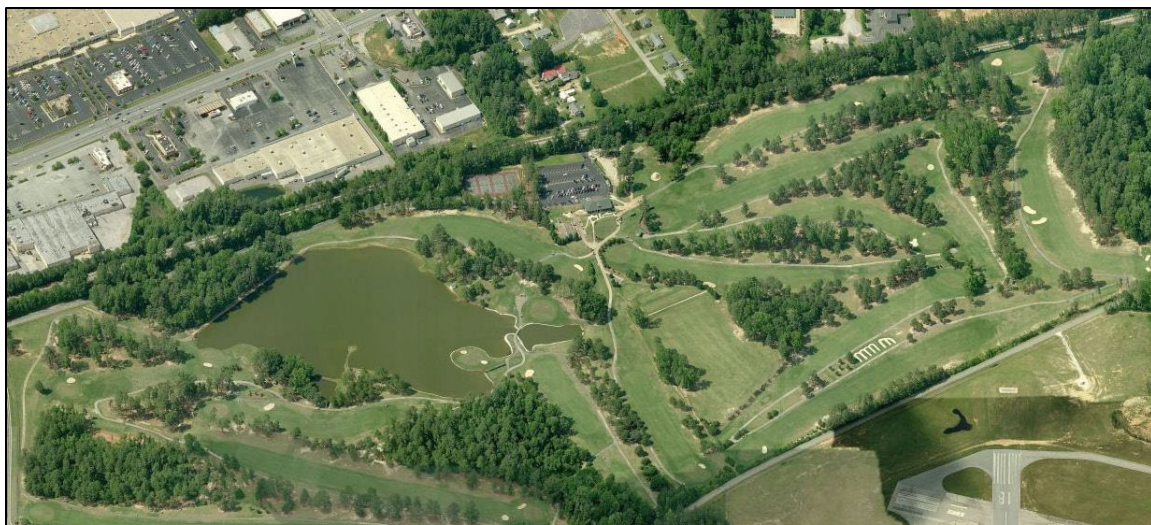
Indian Pines Golf Club (now Pines Crossing)