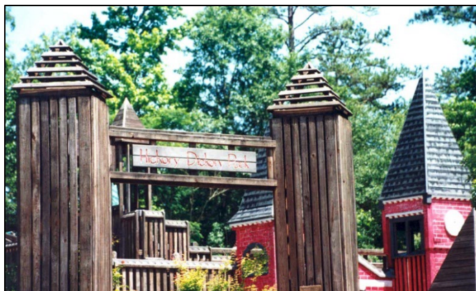
Hickory Dickory Park