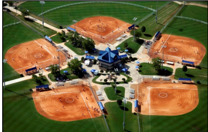
Auburn Softball Complex

Other Boards and Commissions not formed by the City Council include: