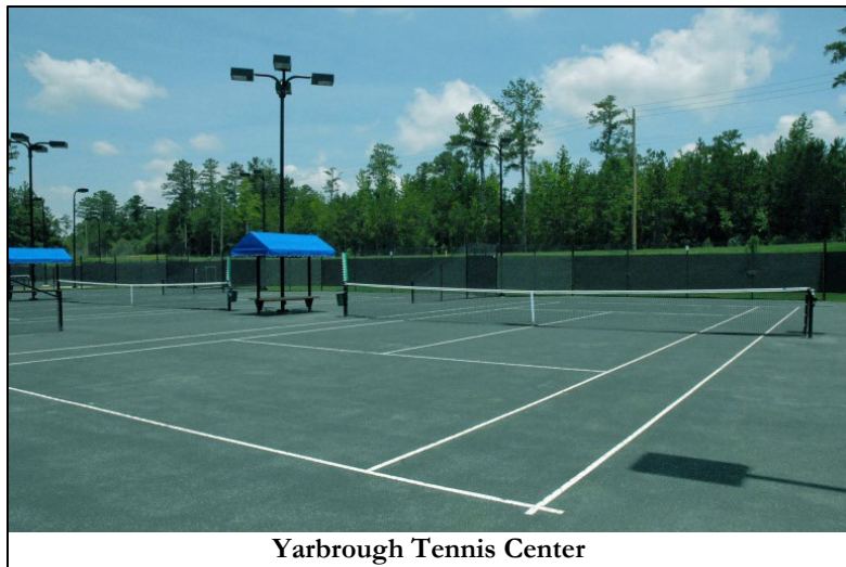
Yarbrough Tennis Center

Duck Samford Park and the Bo Cavin Baseball Complex contain 10 lighted baseball fields, seven of which have a press box. The park also features concessions, batting cages and bullpens. The complex was host to the 2002 Dixie Youth Majors State Tournament and hosted the 50th Dixie Youth World Series in 2005. Felton Little Park features three additional lighted baseball fields, a concession area and batting cages.