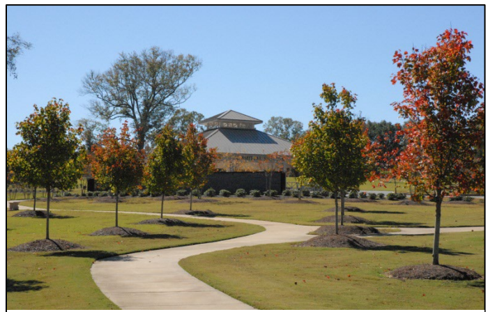
Town Creek Cemetery