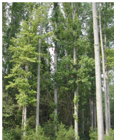
A walking path at Town Creek Park