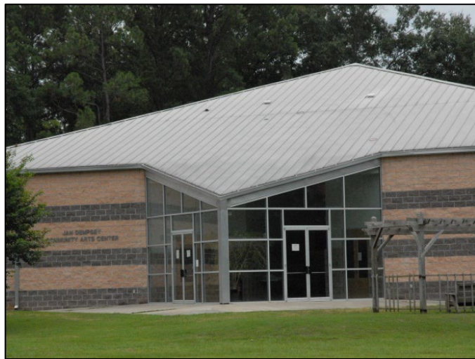
Jan Dempsey Community Art Center

The Jan Dempsey Community Arts Center was constructed in 1999 to better serve the artistic needs of the Auburn area and provide residents and visitors with access to an outstanding, active schedule of exhibitions, musical concerts, lectures, art classes and special events for children and adults throughout the year. The Community Arts Center contains an art gallery, two studio/classrooms, a children's gallery, a conference room, and a performance room. The arts center works closely with the Auburn Arts Association and other local artists to make sure the community is receiving top-notch art education and leisure activities.