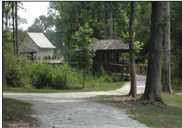
Town Creek Park