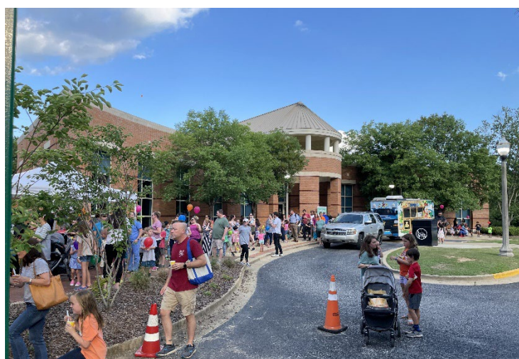
Auburn Public Library

The Auburn Community Orchestra evolved from the Auburn University Orchestra, which ceased operations in 1997. Auburn University Orchestra members felt the cultural atmosphere of the community would be diminished without regular orchestral concerts. Therefore, they formed the Community Orchestra to ensure the survival of quality orchestral music in the community and the surrounding area. The Auburn Community Orchestra is dedicated to its mission to present orchestral concerts to the citizens of Auburn, Opelika, and East Alabama, and presents a fall concert each year, often at Kiesel Park.