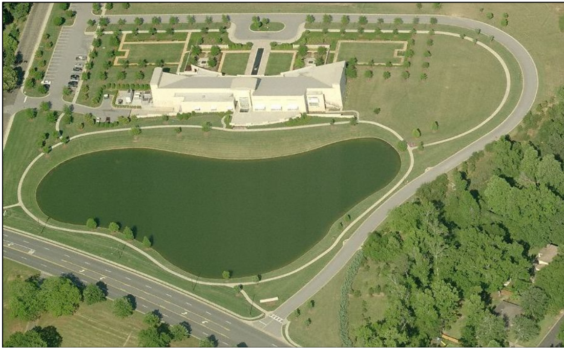
Jule Collins Smith Museum of Fine Art (Bing)

The Jule Collins Smith Museum of Fine Art was opened to the public by Auburn University in 2003. The 40,000 square foot art museum is located on South College Street, one of the City's major gateways. The museum includes seven exhibition galleries, a museum shop, a café, auditorium, a terrace overlooking a lake, and 15 acres of botanical gardens displaying a large-scale sculpture, and a landscape including walking paths, benches, and water features.