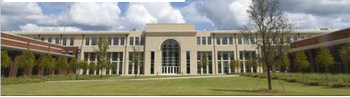
AUBURN HIGH SCHOOL 1701 East Samford Ave.

Auburn's City Schools are housed on 14 different campuses with 1 high school, 1 junior high, 2 middle schools, and 10 elementary schools. ACS has six schools with national distinction.