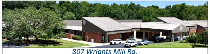
WRIGHTS MILL ROAD ELEMENTARY