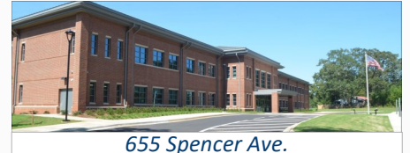
J.F. DRAKE MIDDLE SCHOOL