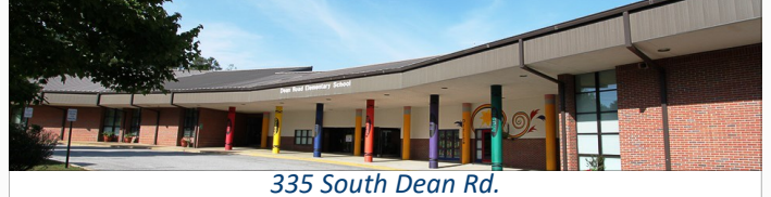
DEAN ROAD ELEMENTARY