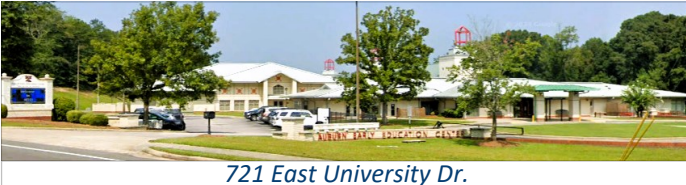
AUBURN EARLY EDUCATION CENTER