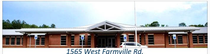
WOODLAND PINES ELEMENTARY