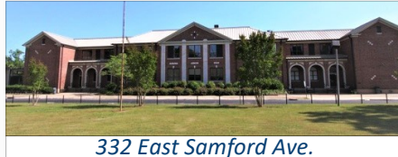
EAST SAMFORD MIDDLE SCHOOL