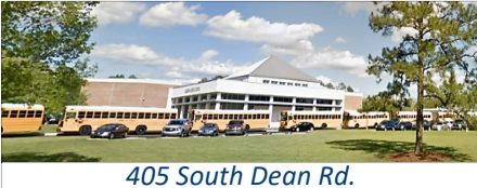
AUBURN JUNIOR HIGH SCHOOL