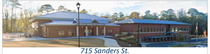
CARY WOODS ELEMENTARY