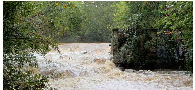
Water rushes through Moores Mill Creek after a heavy rainfall.

Contact your insurance agent to see if your property is covered for flood damage. Additional information on flood insurance can be found at auburnal.gov/engineering-services/flood-protection .