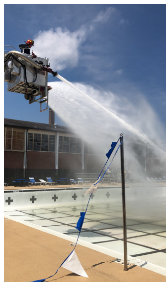
The Auburn Fire Department helps refill the pool after it has been drained and cleaned during the off season.