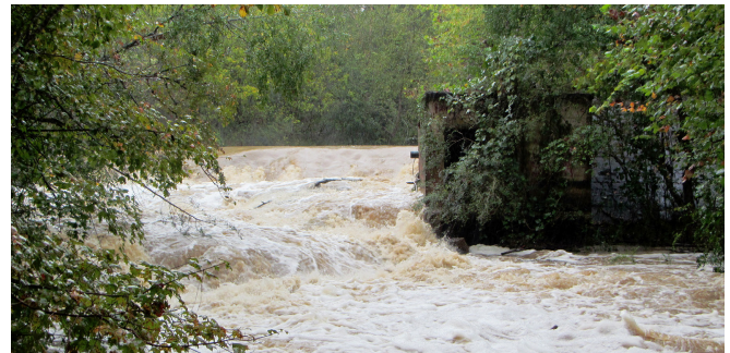
Water rushes through Moores Mill Creek after a heavy rainfall.

Contact your insurance agent to see if your property is covered for flood damage. Additional information on flood insurance can be found at auburnalabama.org/engineering-services/flood-protection .