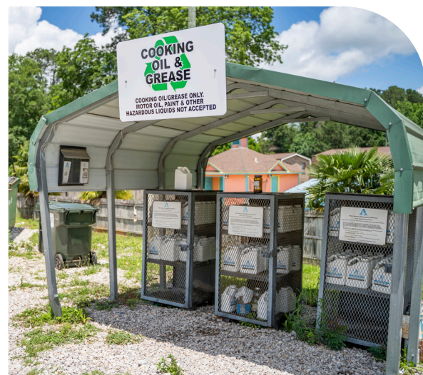
The Cooking Oil and Grease recycling receptacle is located at the Recycling Drop-Off Center, 365-A N. Donahue Drive.

For more information, visit auburnalabama.org/water-resource-management/fog-recycling or contact the Water Resource Management Department at (334) 501-3060 or webwtrswr@auburnalabama.org .