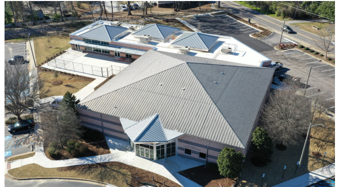
The 10,000-square-foot facility was renovated and an 8,000-square foot addition was constructed.