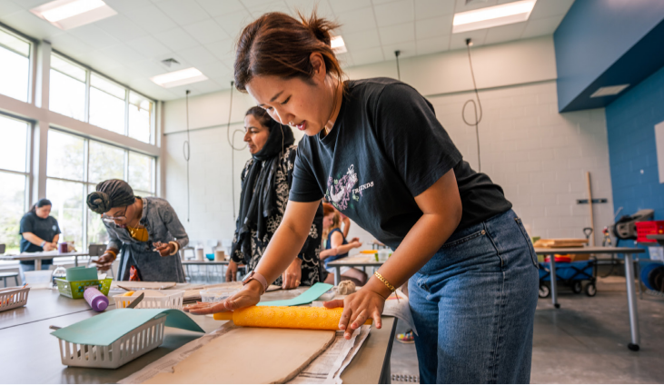
Day in Clay participants press texture into clay as they form elements they will shape into mugs and pots.

versatility that wasn't possible at Dean Road. Before, they could only accommodate up to seven pottery wheels at a time. That has more than doubled in the new space, which has a capacity for 20 wheels. At Dean Road, there was one room for hand-building and one for wheel-throwing. In the new space, there are two significantly larger rooms that are more versatile and can accommodate both hand-building and wheel-throwing classes simultaneously. A large kiln with a higher firing capacity was added to the studio, bringing the total number of kilns to five.