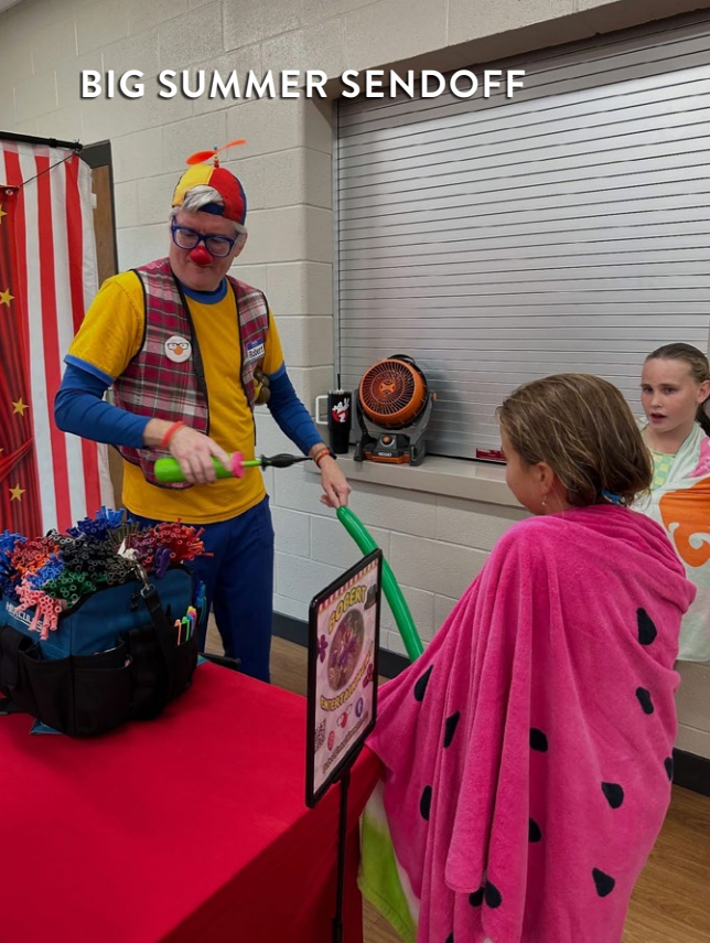
BIG SUMMER SENDOFF