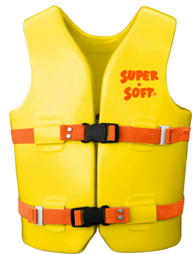
Children's Life Vest TYPE 2