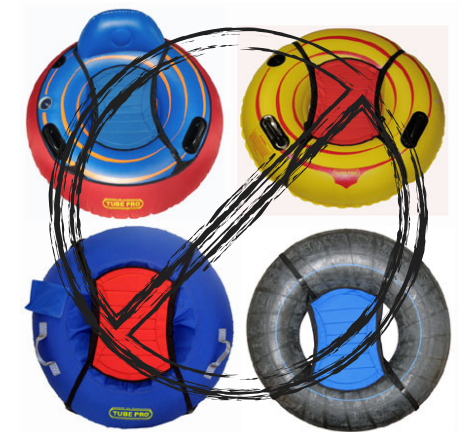
Inner Tubes with Seats