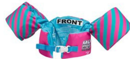
Water Wings with Belts

*Life vests are available at no charge on a first-come, first-serve basis.*