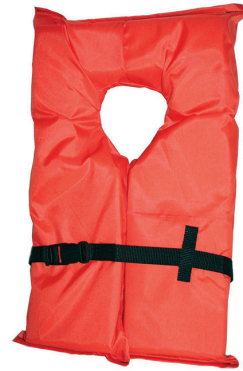
Basic Life Vest TYPE 2