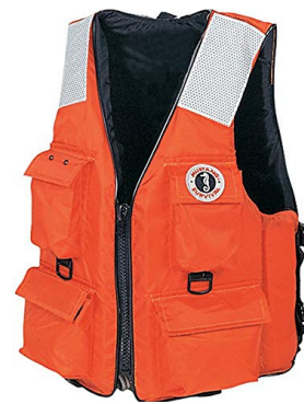
Standard Life Vest TYPE 2