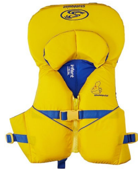
Infant Life Vest TYPE 2