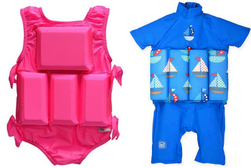
Flotation Swim Suits TYPE 3