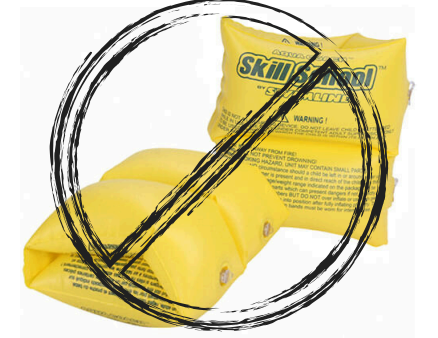
Water Wings/ Arm Floaties