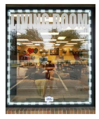
This prohibition does not include neon lighting on buildings or holiday and community decorations.

Display of vehicles, equipment or other merchandise for sale, lease or storage shall be on a paved surface.