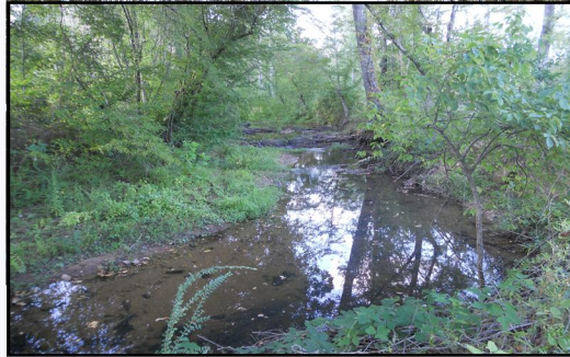
Cleaner streams provide a benefit to all