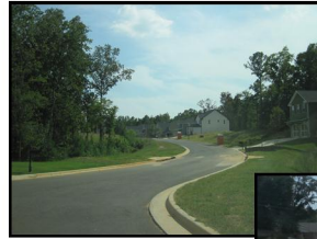
Good erosion and sediment control with vegetated cover and inlet protection.