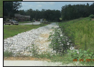
Good sediment control measures.